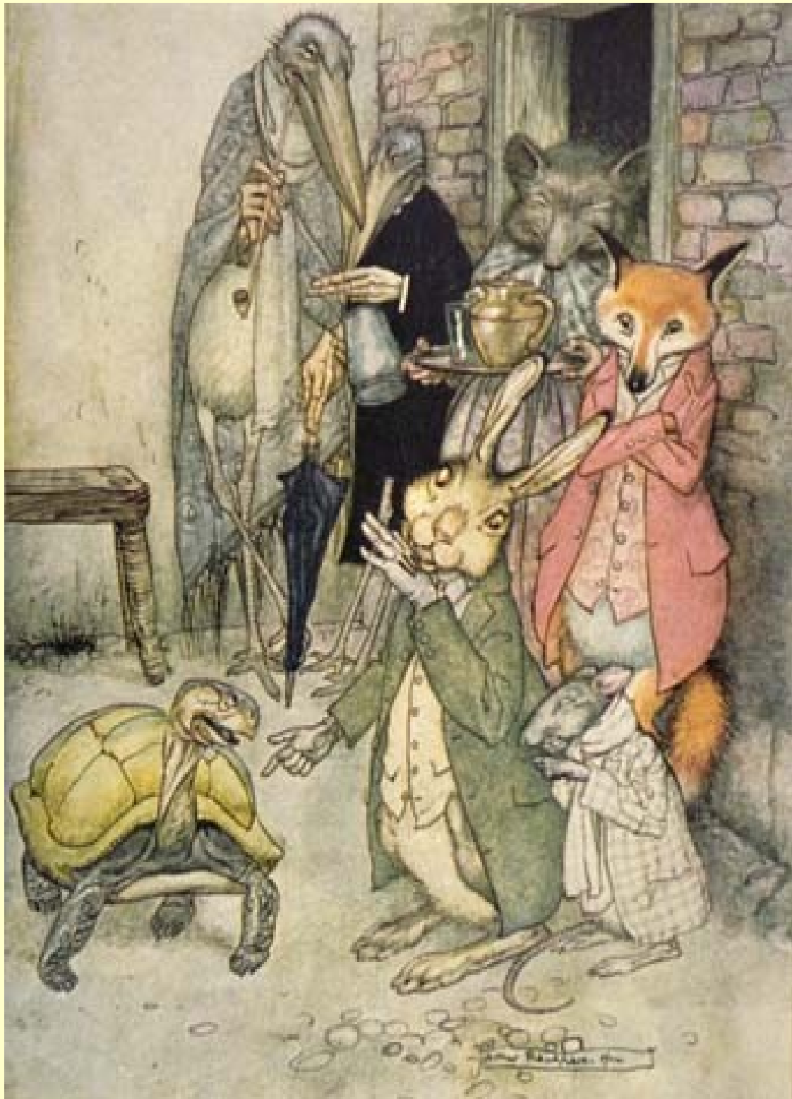
Arthur Rackham (1867-1938)